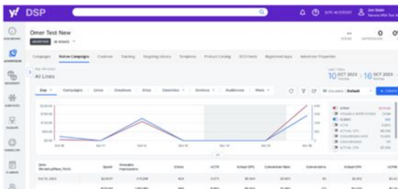
Taboola Ads Console is live within Yahoo DSP

We’ve launched our first Omnichannel advertisers with very promising results. In summary, we have seen good progress on migration to date and we’re seeing encouraging results for our advertisers. Lots of work still to do, but feeling good about the progress so far.